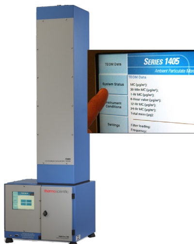
Thermo Scientific™ TEOM™ 1405-DF Ambient Particulate Monitor

The 1405-DF monitor provides a self-referencing, NIST-traceable true mass measurement using our own proven high reliability TEOM technology. The system differentiates itself from other PM measurement methods by utilizing a direct mass measurement that is not subject to measurement uncertainties found in surrogate techniques such as beta attenuation, light scattering and pressure drop.